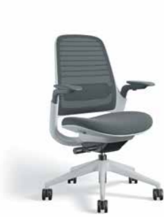
Standard Height Weight activated