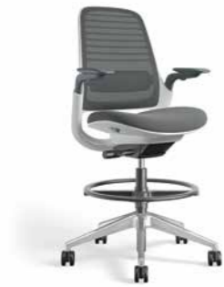
Stool Height Weight activated