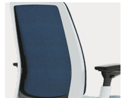
Fabric Back Cover