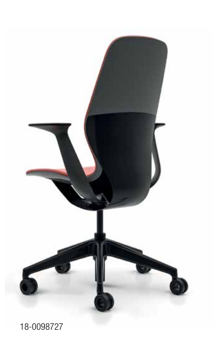
PLATINUM SOLID PLASTIC + CARBON FIBER WEAVE*