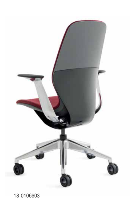
MERLE PLASTIC + BLACK GLOSS PAINT*