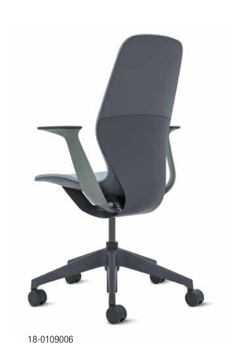
MERLE PLASTIC + MERLE PAINT