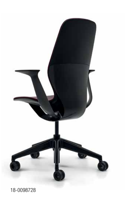
MERLE PLASTIC + CARBON FIBER WEAVE*