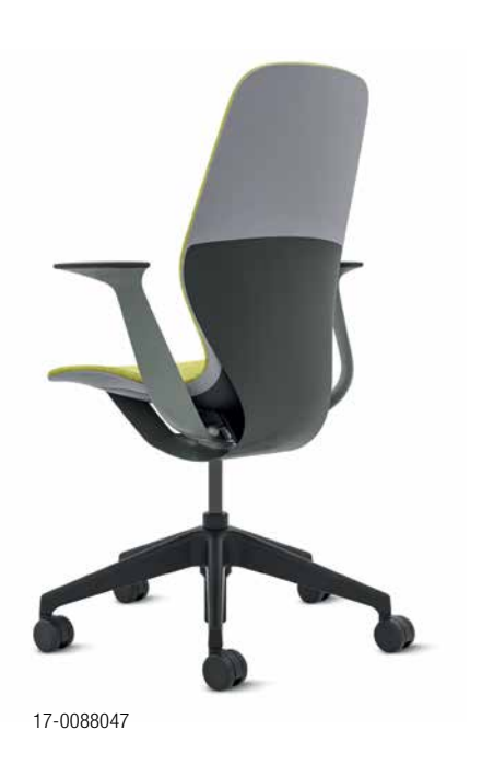
PLATINUM SOLID PLASTIC + MERLE PAINT