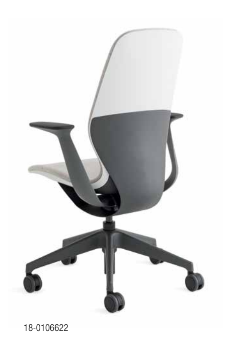
SEAGULL PLASTIC + MERLE PAINT