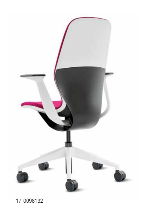
SEAGULL PLASTIC + CARBON METALLIC PAINT