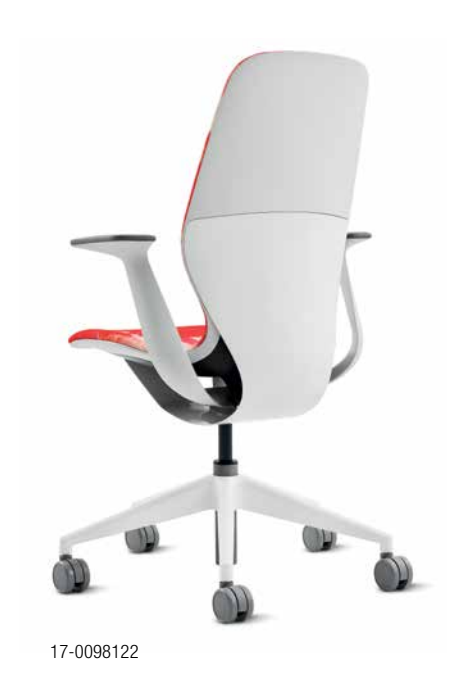
SEAGULL PLASTIC + ARCTIC WHITE PAINT*

Available in carbon fiber and the new high-performance polymer, the range of materials is unprecedented.