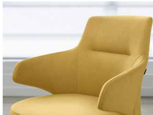
———— Conference chair. Firm and tailored upholstery for a more formal expression.