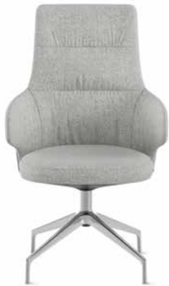
Mid-Back Duvet Integrated Arm 4-Star Base

Massaud Conference Seating brings forward-thinking design and applied seating science to the diverse places where people meet. Sculpted in form, engineered for comfort, and crafted with precision, this chair is a modern classic that you can tailor to fit your style of work.