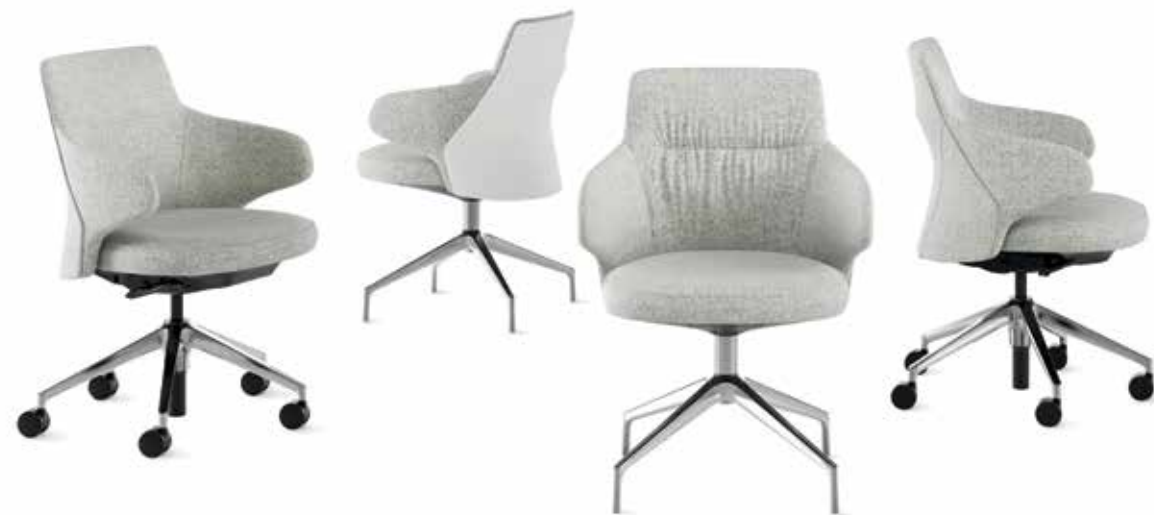
Low-Back Conference Chairs Integrated Arm

Created in collaboration between the Coalesse Design Group and Jean-Marie Massaud, this is a chair that adds fact to form. Every detail is driven by advanced engineering to assure optimised comfort from the inside out. Our science shapes a better chair to support productivity and generously fit the body.