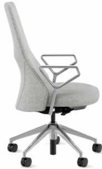
Mid-Back Loop Arm 5-Star Base