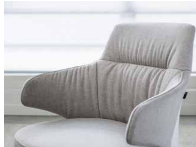
———— Duvet conference chair. Plush and quilted upholstery for a softer, casual look.

Personal by design, for the perfect fit every time. Two refined upholstery techniques allow for many tailorable expressions, in crisply fitted or soft duvet styles. With mid or low backs, up to three fabrics, and a choice of arms and bases, you can mix and remix to customise each chair from a range of standard seating options to meet in your own style.