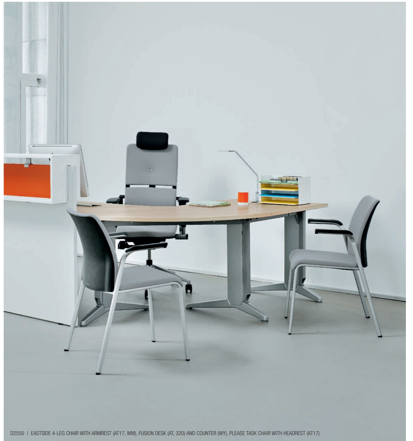
D2550 | EASTSIDE 4-LEG CHAIR WITH ARMREST (AT17, WM), FUSION DESK (AT, 320) AND COUNTER (WY), PLEASE TASK CHAIR WITH HEADREST (AT17)