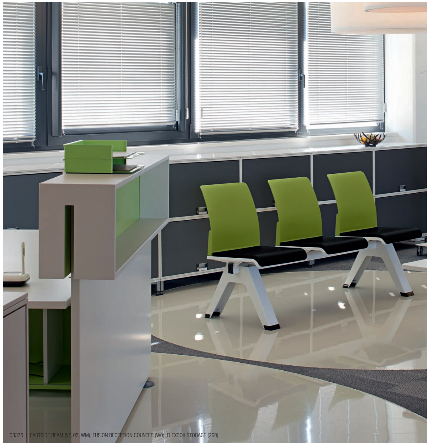
C8375 EASTSIDE BEAM (VP, 05, WM), FUSION RECEPTION COUNTER (W0), FLEXBOX STORAGE (260)