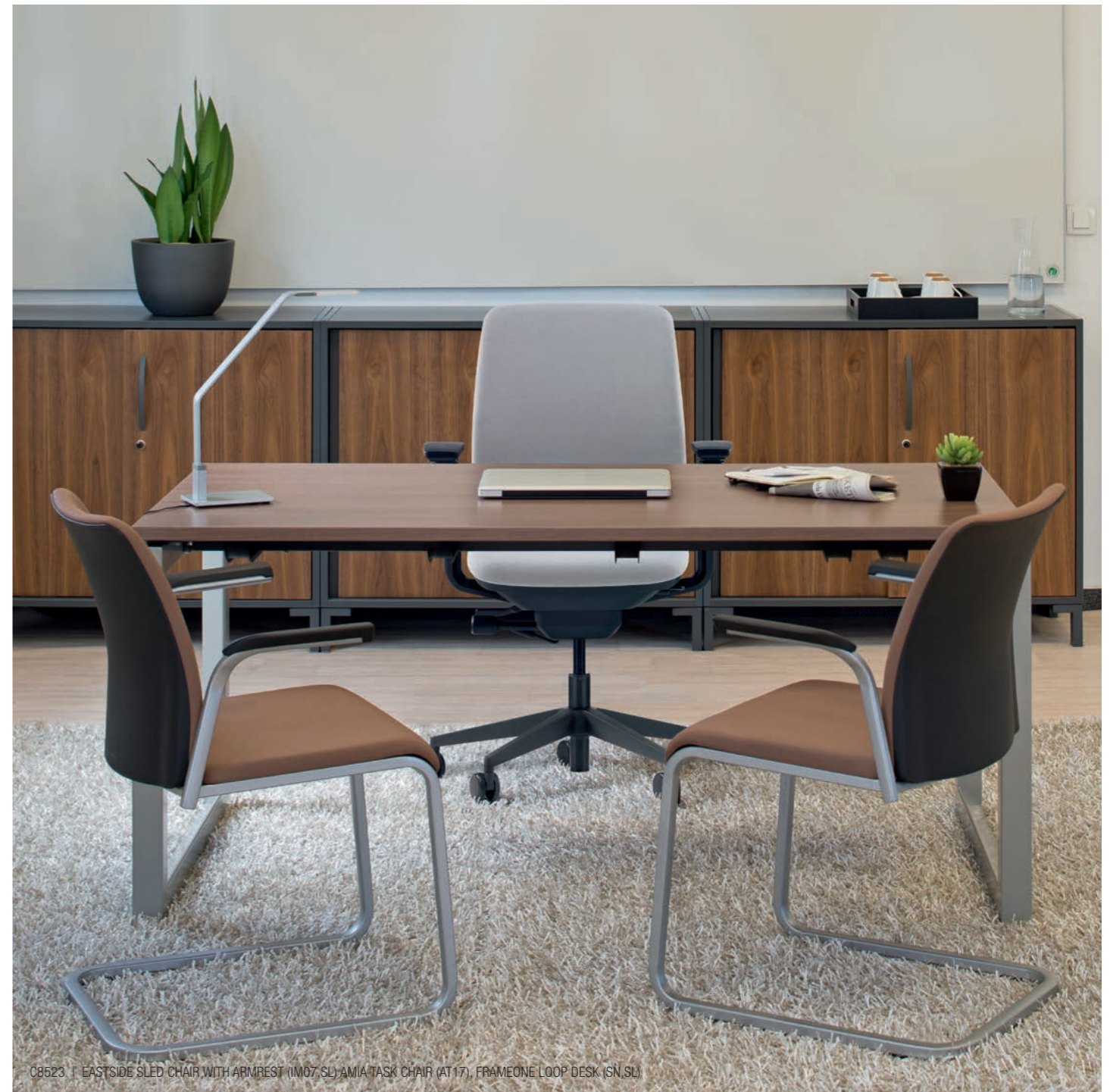
C8523 | EASTSIDE SLED CHAIR WITH ARMBEST (1M07, SL) | AMIA TASK CHAIR (AT17) | FRAMEONE LOOP DESK (SN, SL)

With its elegant touch and modern design, Eastside matches the task chairs ranges and can be used as a visitor chair.