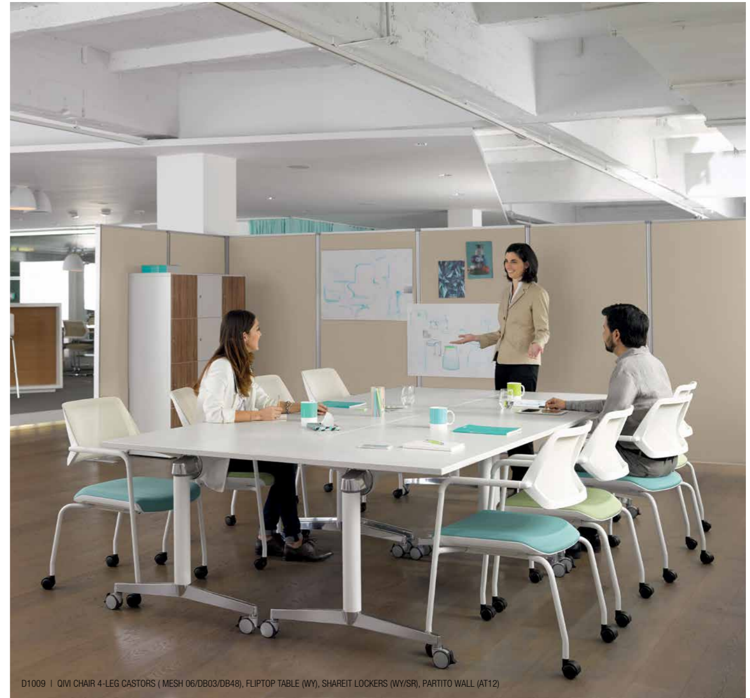
D1009 | QIVI CHAIR 4-LEG CASTORS ( MESH 06/DB03/DB48), FLIPTOP TABLE (WY), SHAREIT LOCKERS (WY/SR), PARTITO WALL (AT12)

Qivi is the ideal collaborative chair for working in pairs, smaller or larger groups. It helps keep meetings productive, whether they are being held in informal office areas, traditional meeting rooms or boardrooms.