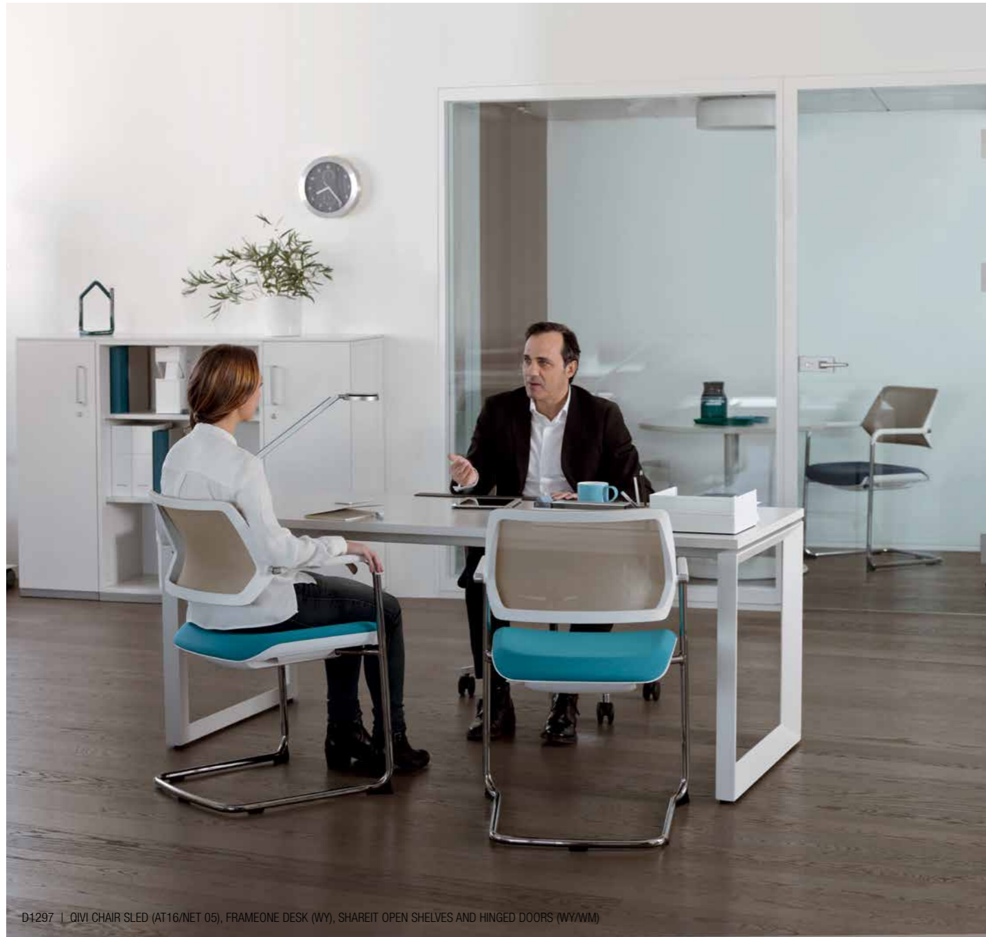
D1297 | QIVI CHAIR SLED (AT16/NET 05), FRAMEONE DESK (WY), SHAREIT OPEN SHELVES AND HINGED DOORS (WY/WM)