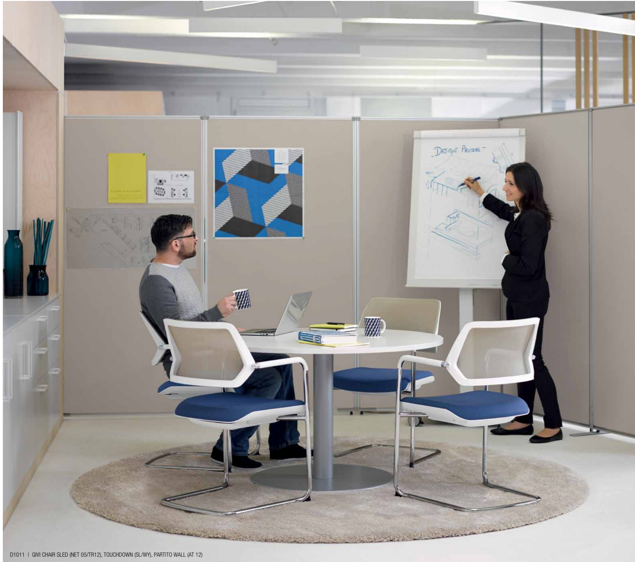
D1011 | QIVI CHAIR SLED (NET 05/TR12), TOUCHDOWN (SL/WY), PARTITO WALL (AT 12)