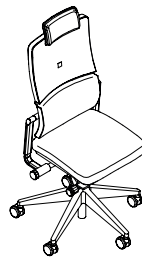
Task Chair with Headrest