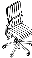
Task Chair with Signature Stitching