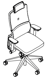
Executive Chair with leather and polished aluminum