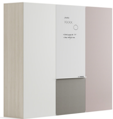
Whiteboard*, Melamine, Fabric