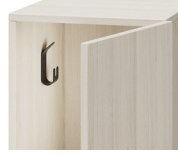
Coat/Bag Hook** (available for locker units 750mm or higher)