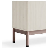
220mm Frame Base with Cable Tray*

*Compatible with cabled networked locks.