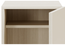
Adjustable Recessed Shelf** (available for locker units 400mm or higher)