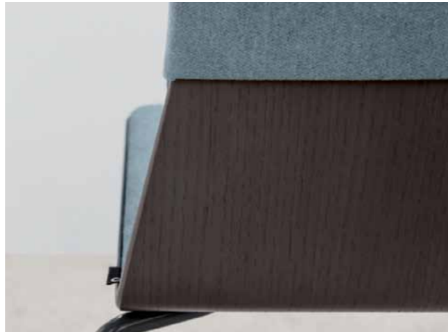
Upholstery details. Dress seating up or down with multiple options ranging from all wood to fully upholstered shells – and a distinctive three-quarter upholstery detail.