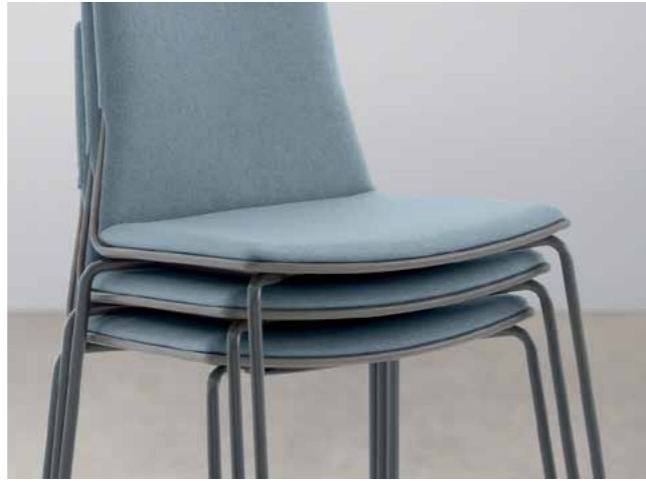
Stackable seating. 4-leg and sled base chairs stack up to six high – offering a touch of luxury to a pragmatic workplace need.

Stackable doesn't have to be predictable. The Montara650 Chair is not an afterthought for short-term seating but a well thought-out solution for impromptu meetings. The sculpted oak-veneered plywood shell is comfortable on its own and more so with a seat cushion or fully upholstered. Warm and appealing, Montara650 is emotionally satisfying, a touch of luxury at an affordable price point.