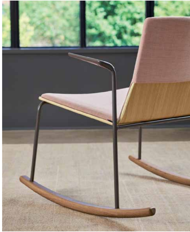
Seating in motion. The modern, sculpted form of the Montara650 Lounge becomes the basis of a new rocking chair.

Casual meetings at work can be the most productive. Yet casual seating tends to be uninspired. The Coalesse Design Group has collaborated with Spain's Lievore Altherr Molina to create a refined alternative. The Montara650 Collection is classically casual infused with comfort and craft. Its sculpted chairs, stools, rocker and lounge are paired with simple pedestal tables in multiple shapes and heights, and uniquely power-ready. Highly customisable, Montara650 fills informal spaces with café-style character tailored the way you want it. An inspired social solution for today's mobile workforce.