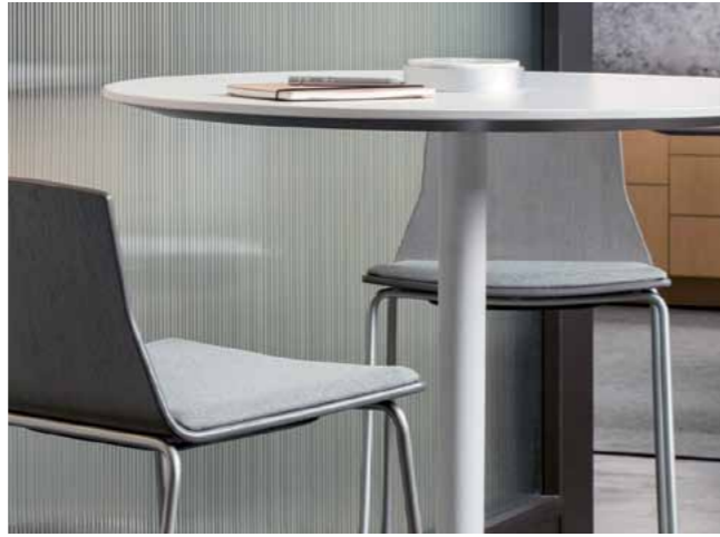
Table power. Optional PowerPod module brings power to the tabletop – on work, café or occasional tables. Charge your devices between meetings or during impromptu conversations.

Highly adaptable, the Montara650 Collection will fit with your existing assets or fill the vital social spaces of a new project. Tailor it to your style of work. The oak-faced shell is available in five subtle stains. It can be upholstered fully or in a unique three-quarter style that enhances comfort while maintaining the warmth of wood. Select from four legs or a sled base, with arms or armless, in trivalent chrome or painted to your palette. The sturdy, elegant Montara650 table is available in multiple heights and shapes and can be finished in any laminate or veneer. An optional PowerPod expands your application choices.