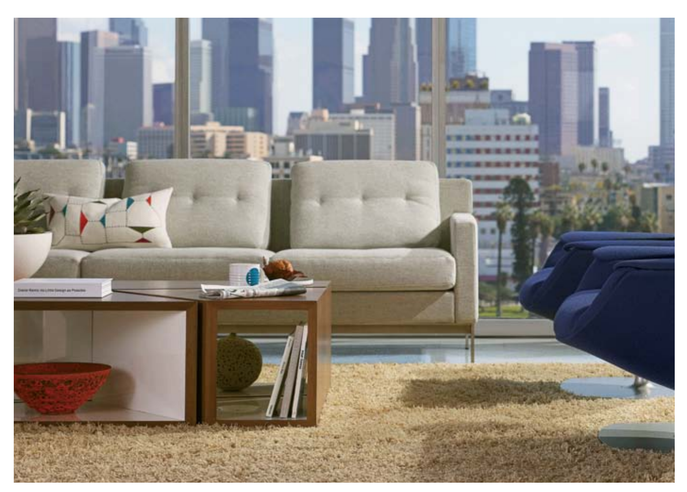
Millbrae Lifestyle seating shown with Sebastopol tables and Massaud Lounge seating

— The soft Lifestyle series is designed for relaxed postures in a social officing setting. It creates a social feel in your workplace. It is generously proportioned with plush cushions and an elegant cross-stitch tufting detail.