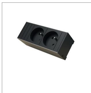
Basic with 2 power sockets (EURO plug with French / Belgium and Schuko sockets, Swiss sockets and UK sockets)