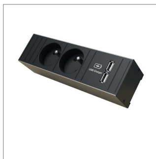
2 Power sockets + 2 USB ports