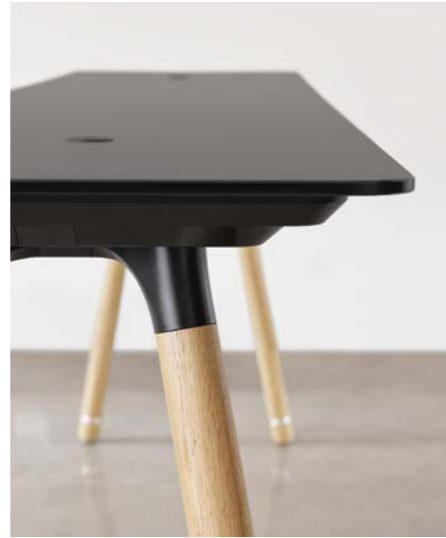
Choose laminate, veneer, Fenix or glass top materials.

Make your mark with distinct design details — rich top and leg materials, and leg rings. Wood legs bring quintessential warmth and character to enhance a workspace and evoke positive emotional connections.